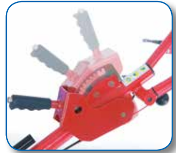
HOPPT® Quick-Pitch Control System (Optional)