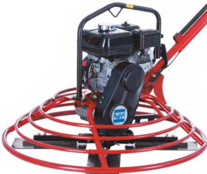
TOL100GB Power Trowel