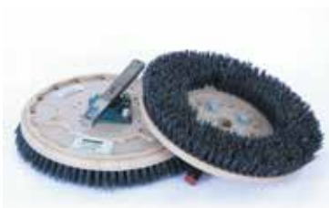
Revolutionary Brush System for Surface Cleaning