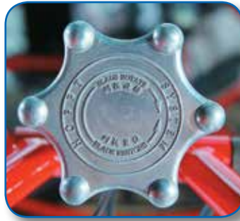
HOPPT® Screw-Pitch Control System (Standard)