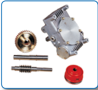
Heavy-Duty Gear Box For 'GB' Models