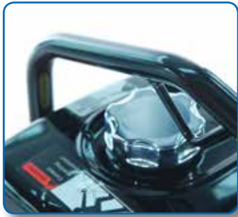
Central Lifting Point