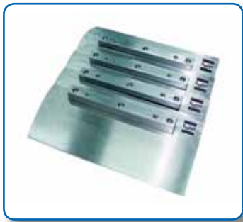
HOPPT® Combination Blades