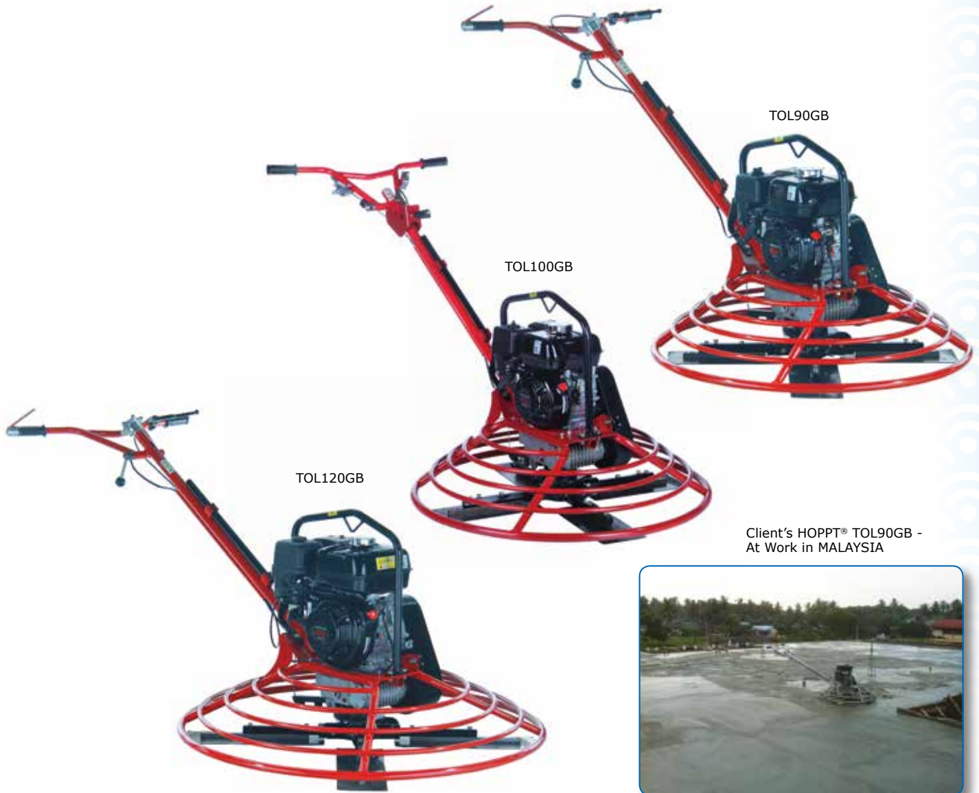
Client's HOPPT® TOL90GB - At Work in MALAYSIA