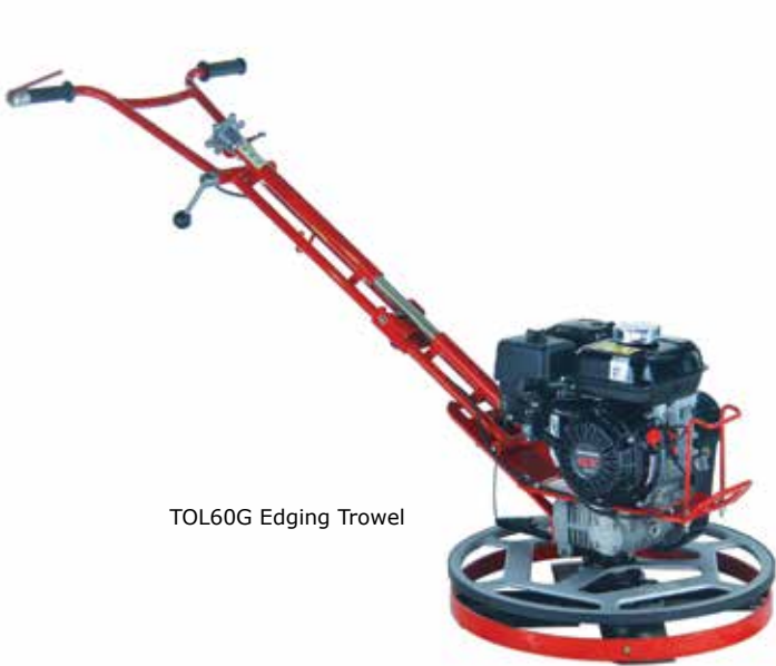
TOL60G Edging Trowel

✓ HOPPT® Range of Edging Trowels are the perfect choice for trowelling along the edges of walls or around protruding pipes and conduits , after usage of HOPPT® Power Trowels. With the availability of various dimensions and sizes, they are versatile even for working in the narrowest places.