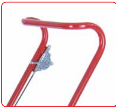
Easy Access to Throttle Control Levers