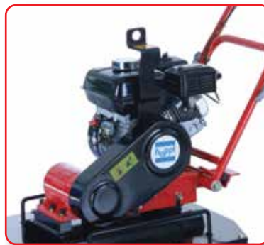
Lifting and Handling Point for Easy Transportation