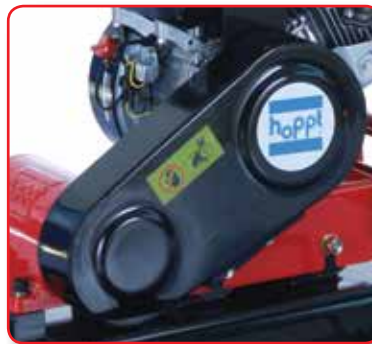
Protective-Covers with a Smudge-Free Look to Protect and Prolong Life-Span of Belts