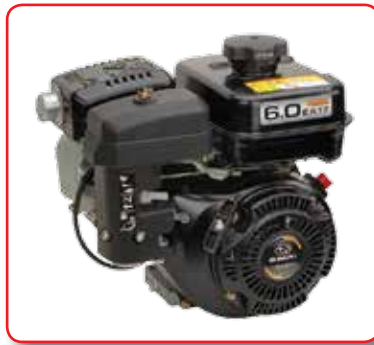
Engine Options for Brand Presence in Users' Countries for Ease of Servicing